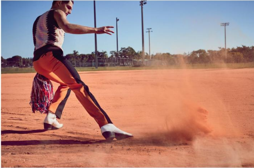
Maill et jacquard de laine, pantalon en gabardine de laine et soie. CALVIN KLEIN 2013W/14.